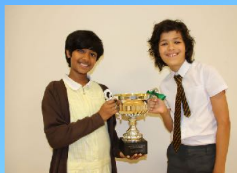
Our Ennis House Captains

Well done to everybody for their hard work and efforts this year.